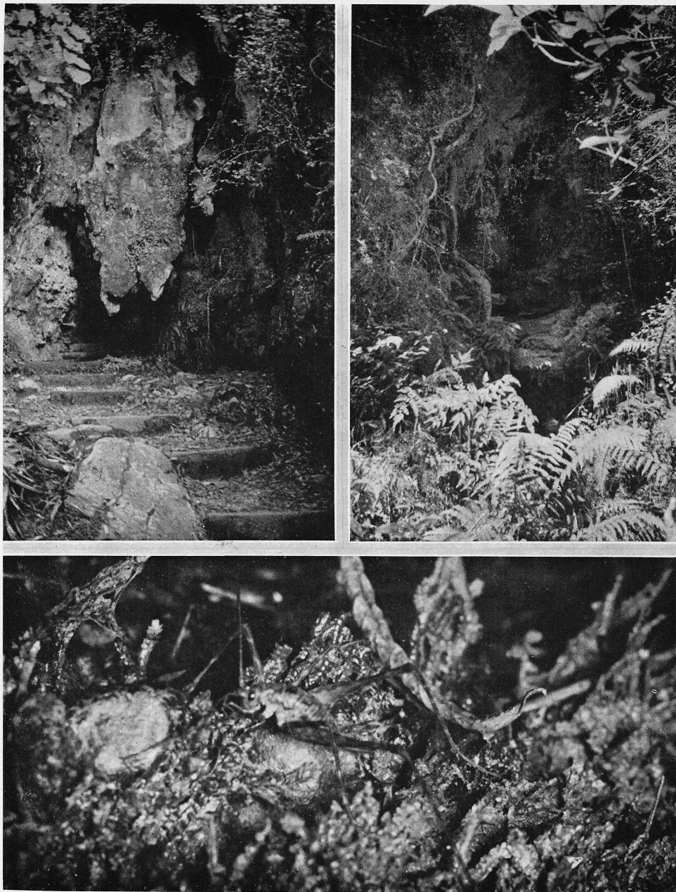
FIG. 1.—(Upper left): Main entrance and smaller entrances to Aranui Cave.