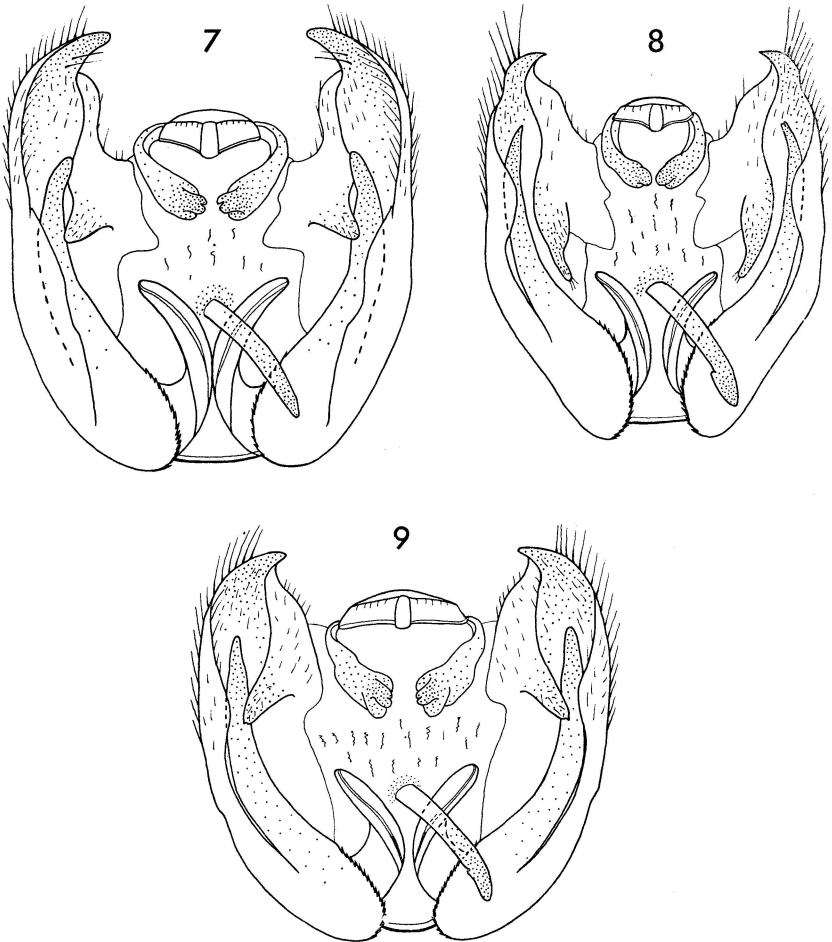
7 Male genitalia, (caudal) Vanessa gonerilla (Fabre); 8 Male genitalia, (caudal) V. itea (Fabre); 9 Male genitalia, (caudal) V. gonerilla x itea hybrid.

This intermediate condition is also reflected in the sclerotized parts of the genitalia of the hybrid which are fully developed. The apex of the cucullus is intermediate between the large blunt form of V. gonerilla and the smaller acute form of V. itea . Similarly the costal lobe of the cucullus is neither as large and blunt as in V. gonerilla nor as acute as in V. itea . The aedeagus and the lobes of the sacculus are also intermediate. Induced hybrids typically exhibit blending of colouring and wing shape, and the hybrid nature of this specimen seems quite straightforward, but